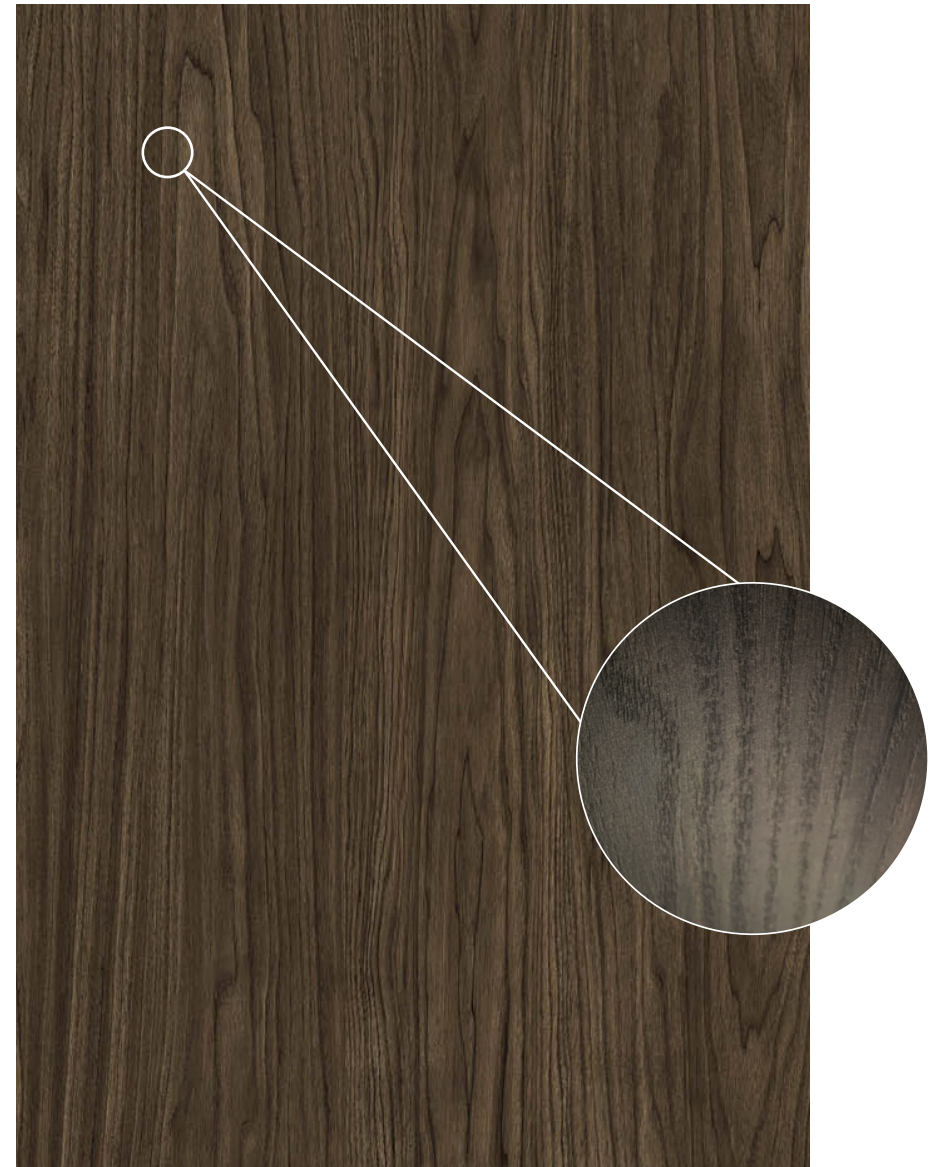
Synchronized texturing that matches the surfaces grain direction.